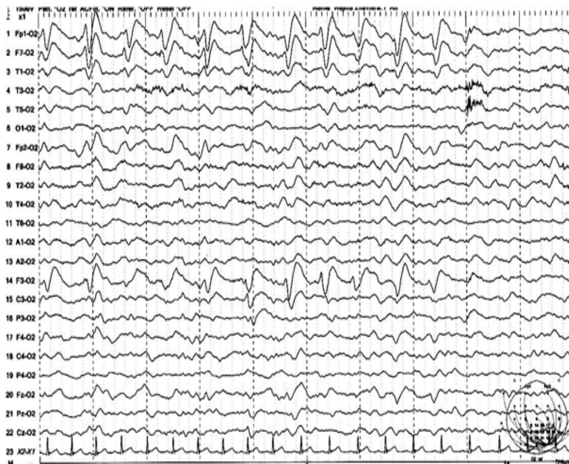
Figure 1. EEG pattern in one TBM patient showing epileptiform waves in left frontal region

In our research, the EEG recordings were found to be abnormal in 75% patients. The most common abnormalities were abnormal III in about 77%. The epileptiform activity potentials were mostly in the frontal and temporal regions, at left frontal region in 2 children, left and right frontal region in 1, right frontotemporal region in 1, left frontotemporal region in 1, right and left temporal region in 1 and bilateral cerebral hemisphere region in 1 child.